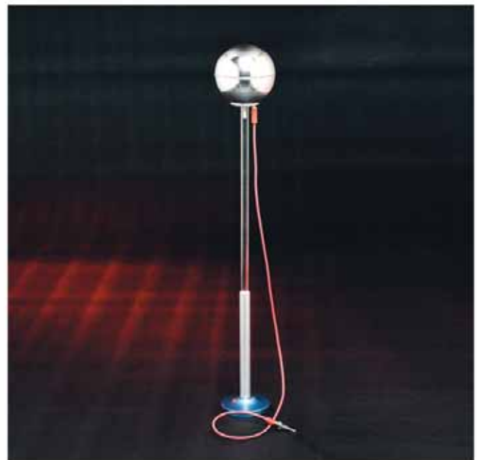
WINSKO Model N-122-B Discharge Electrode (small, with stand)